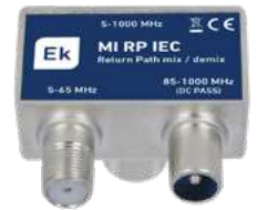
MI RP IEC