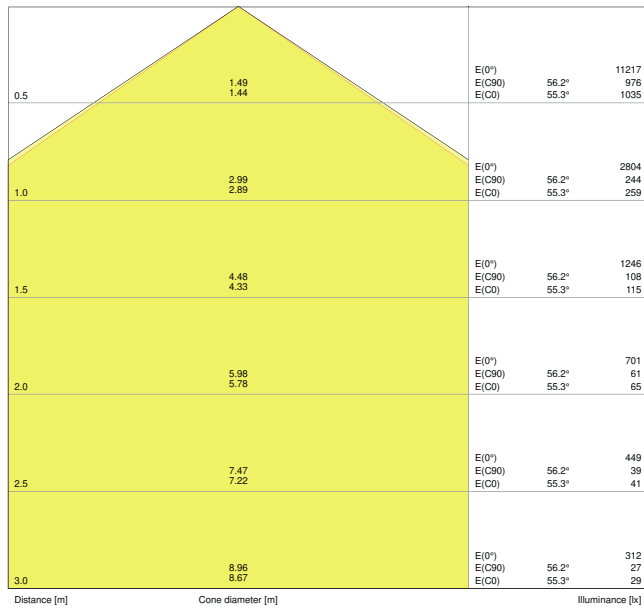
LDC typ cone