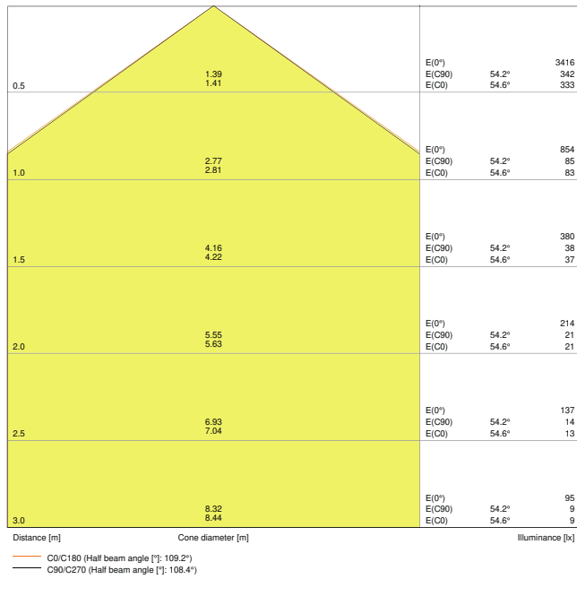
LDC typ cone