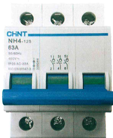
Images of NH4-125

Signed for and on behalf of Zhejiang CHINT Electric Co., Ltd. Chint Industrial Zone, June 20, 2018