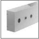
Clinic Gas 298